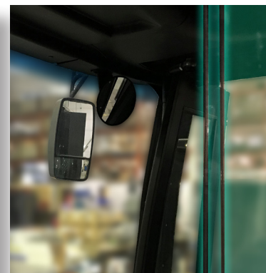
(green cast shows stowed SVP Driver Shield red cast shows room for farebox)